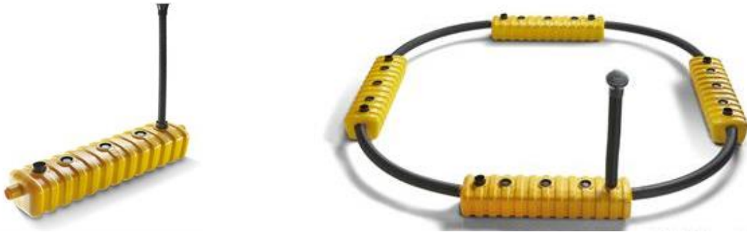
MPS Link 24 (shown in 4-link configuration)